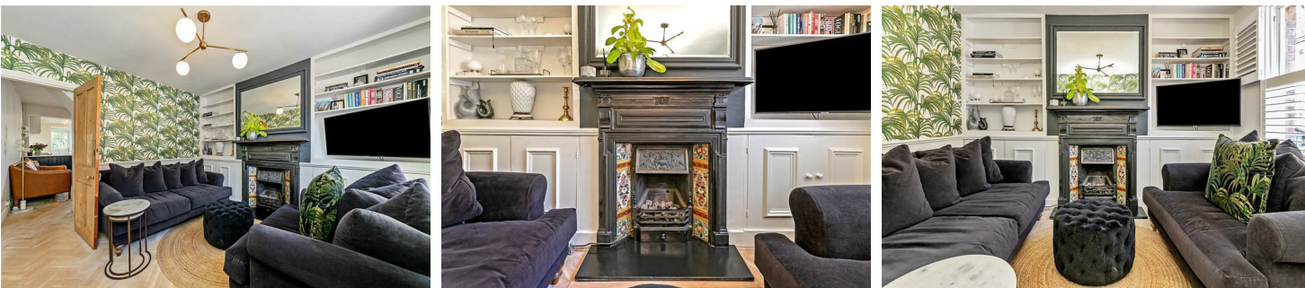
Ground Floor Approx. 348.5 sq. feet

A prime position close to the city centre, the mainline railway station with fast trains into London, and a good primary school, plus an attractive aesthetic appearance makes this three bedroom, two reception end terraced character cottage, a favoured address for professionals and commuters alike. The property is arranged over two floors and internally the property is beautifully presented with a contemporary feel yet retains its character. Practical living accommodation features a living room, the dining room, a lovely fitted kitchen with utility accessing the private enclosed rear garden, three bedrooms and a family sized bathroom. Sopwell Lane is a sought after address, conveniently located for ease of access to the city centre, historical attractions, restaurants and bars as well as the Thameslink mainline station.